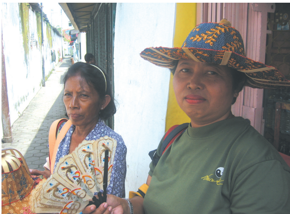
Fans! Fans! Going cheap! Friendly Javanese ladies peddle their stock

Regarding this problem, Afsan Mantoo hopes that the Australian government could be more persistent in campaigning for inter-religious harmony and give a greater chance to Muslims to explain the real Islam. "But what is more important is how can we, as Muslims, together guide the fraternity until it is capable of synergising efforts to erode the negative view of Islam."