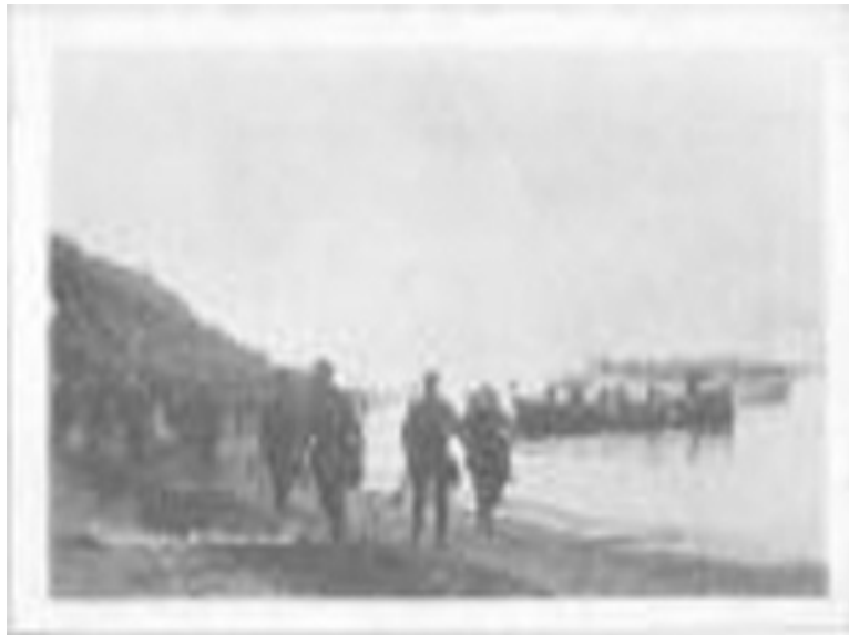
Anzac Cove 1915

Who was their commander? He was the young general of the 19th Division of the Ottoman Fifth Army. His parents had named him after the Beloved Prophet Muhammad (peace & blessings of God