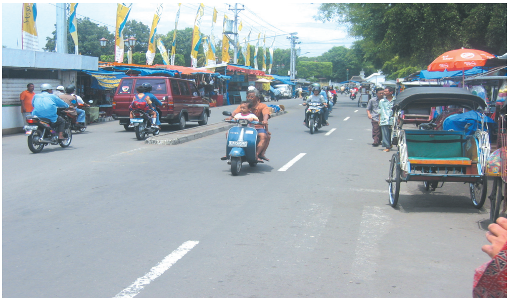
A street scene in Jogja

come to a mosque. There they will receive an explanation about Islam and the basic