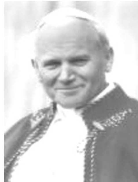
Good relations: Pope John Paul II

"The rebirth of Islam is due in part to the new material richness acquired by Muslim countries, but mainly to the knowledge that it is able to offer a valid spiritual foundation